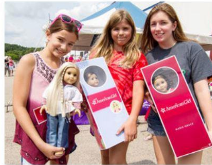
History in the Making