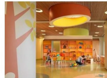
Pediatric Play Lounge