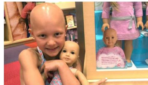
Children's Miracle Network